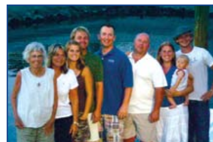
The Swain Family